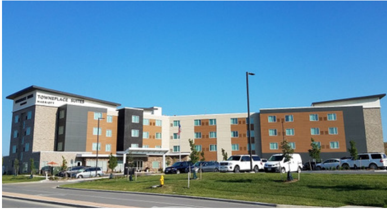
• Town Place Suites Opens