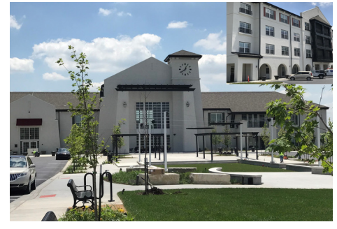
• Norterre Opens