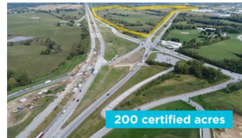
• Heartland Meadows Drone Video Created