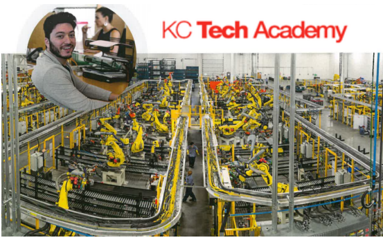
• KC Tech Academy Opens