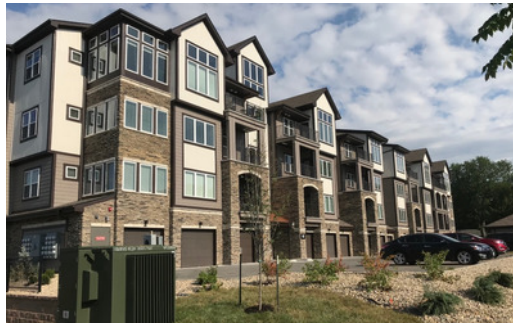
• Copper Ridge Apartments Opens