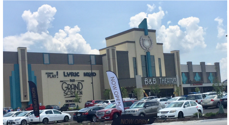
• B&B Theater Opens