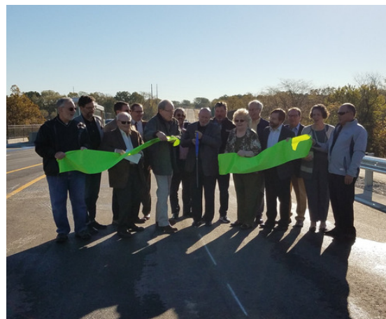
• South Liberty Pkwy Opens