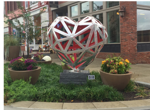
• Liberty Arts Foundation brings arts and culture to our community