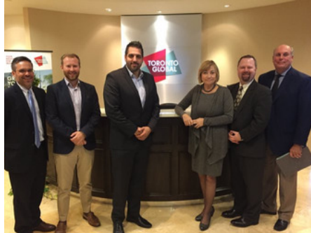
• Toronto Mission Trip